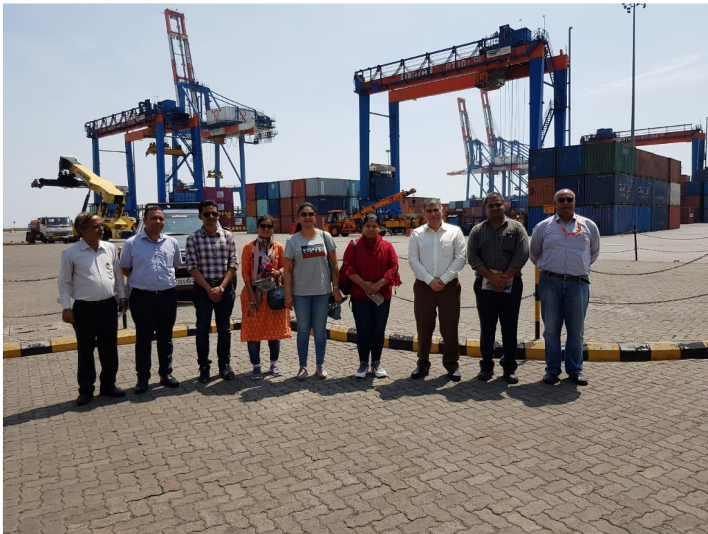
(LtoR: Faculties with KICT Head and staff)

More than 200 students and delegates interacted with the Officers of Deendayal Port Trust. Various questions like actions to be taken in case of Oil spill from vessel, strategy that Kandla Port will adopt to win in the competition against Pipavav Port as well as in Container and Bulk sector, cost cutting strategy were asked by the students. Students get the opportunity to interact with the officers of