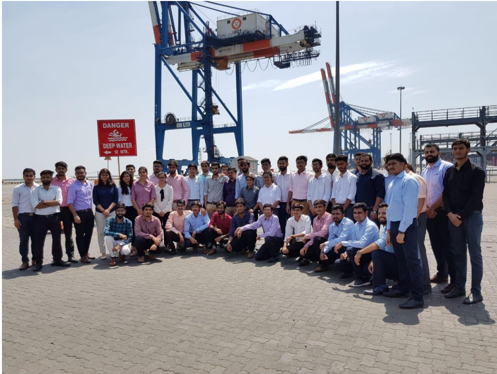
Students at Kandla International Container Terminal