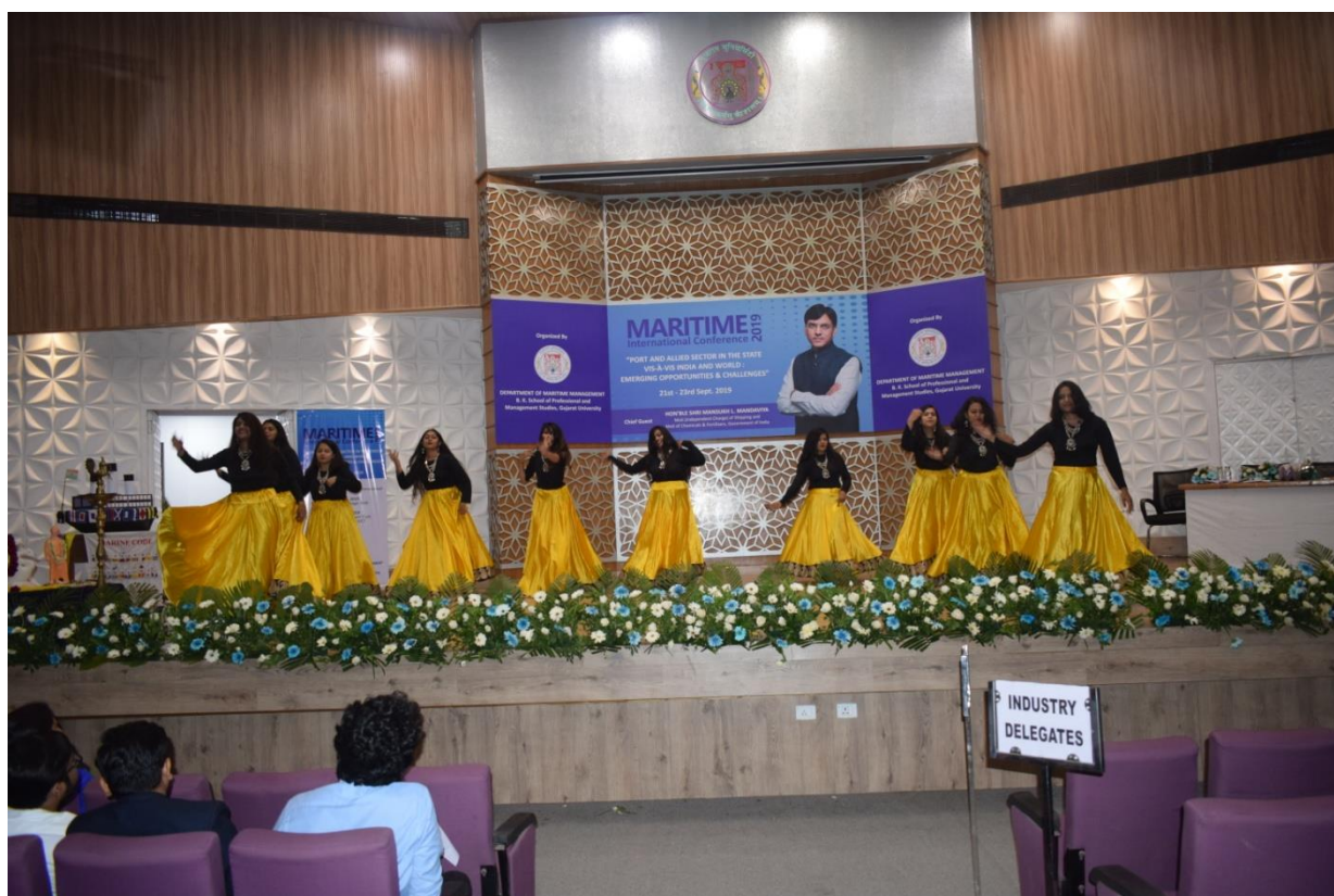
(Students performing dance in Culture evening)

The first day of the conference was a mix experience of learning, fun and entertainment.